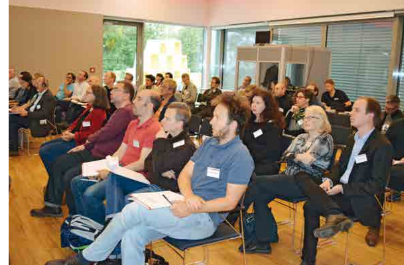
Venue (AK OÖ, Jägermayrhof) and participants of the Linz Conference